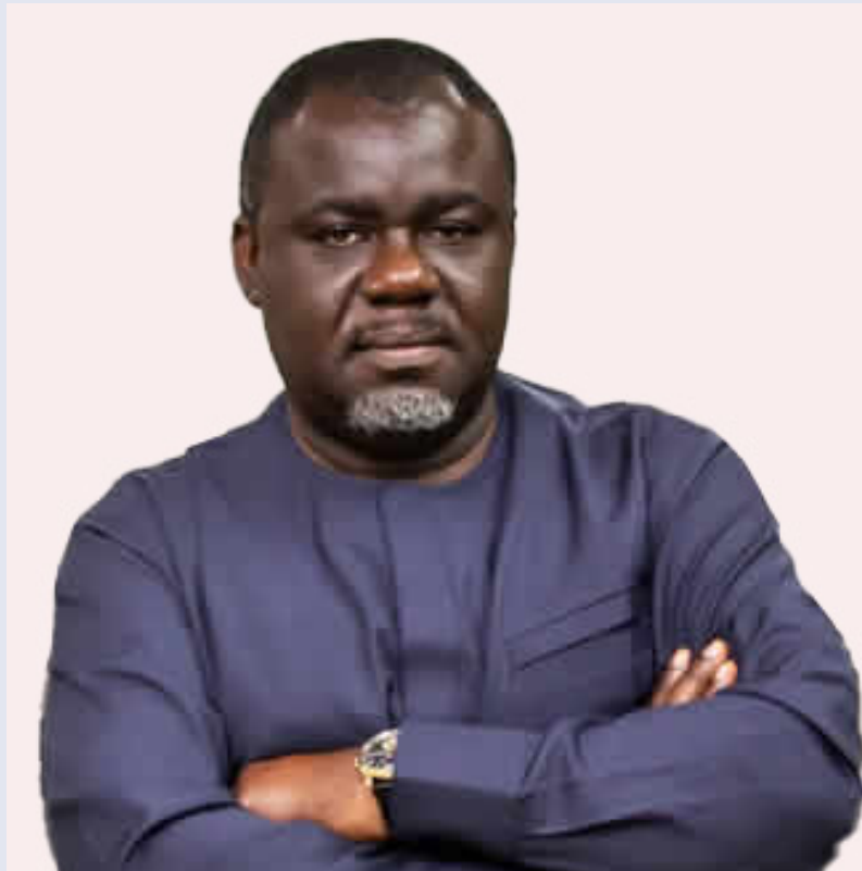
Hon. Kwaku Ofori Asiamah Minister for Transport