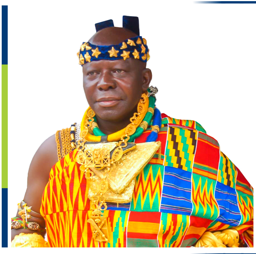
HRM Otumfuo Osei-Tutu II Asantehene