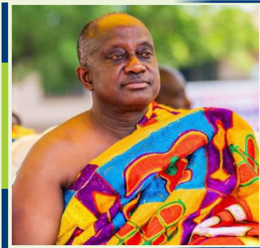
Hon. Simon Osei-Mensah Ashanti Regional Minister