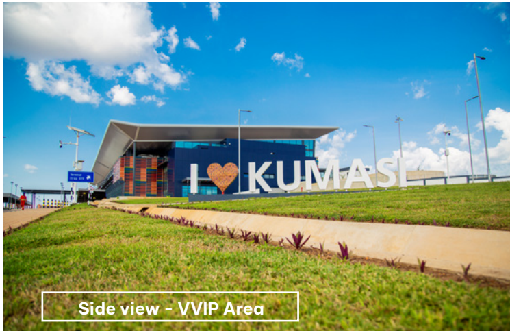
Side view - VVIP Area