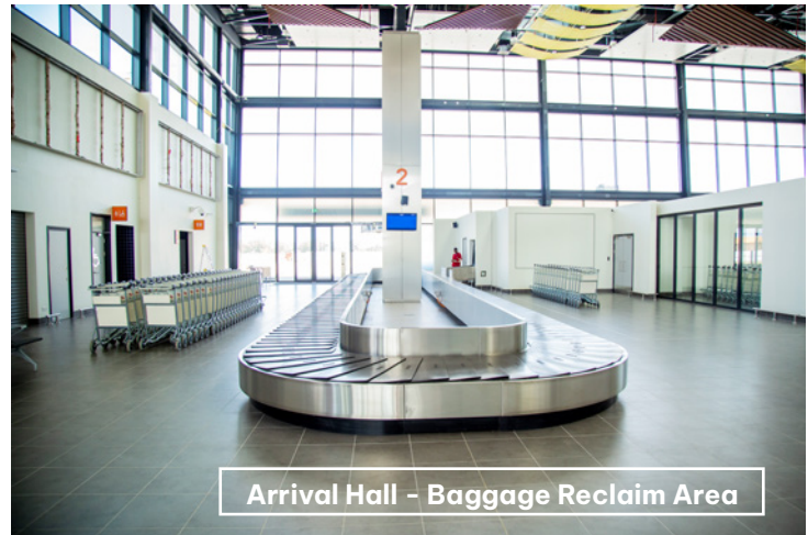
Arrival Hall - Baggage Reclaim Area