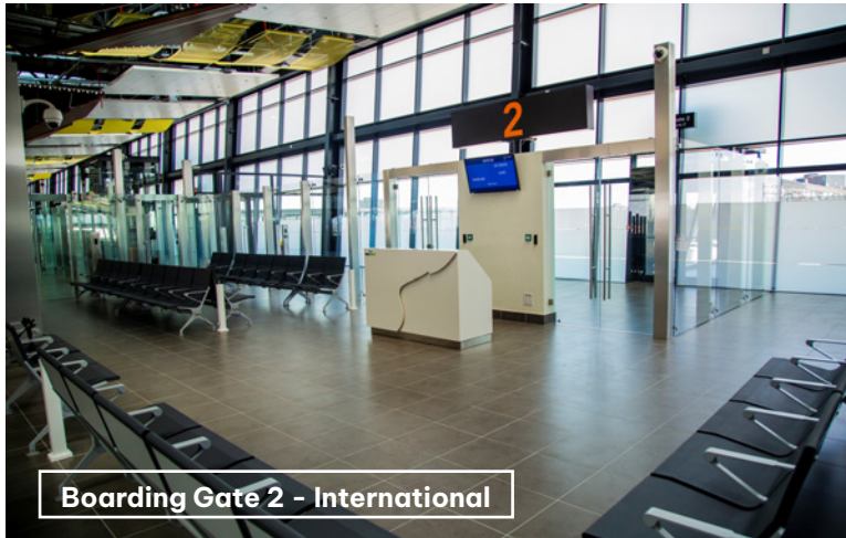
Boarding Gate 2 - International