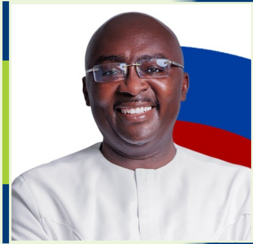
H. E. Alhaji Dr. Mahamudu Bawumia